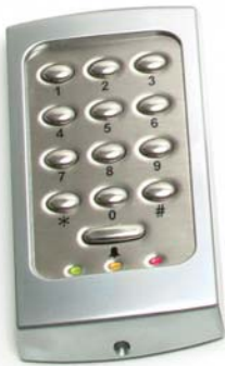
TOUCHLOCK K series stainless steel keypads