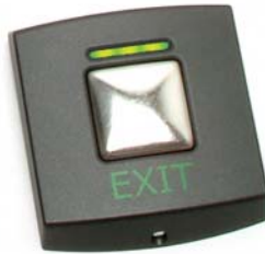
E series exit buttons