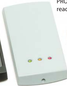
PROXIMITY P series readers