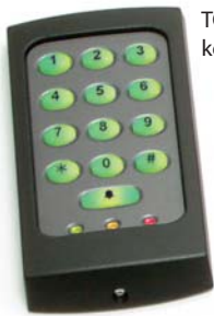
TOUCHLOCK K series keypads